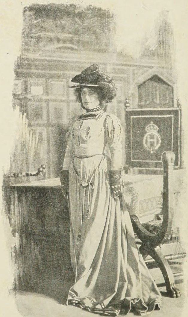
JULIA MARLOWE IN "WHEN KNIGHTHOOD WAS IN FLOWER"